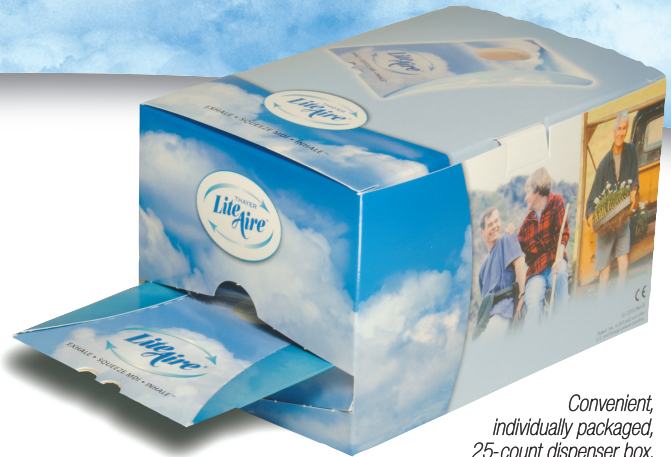
Convenient, individually packaged, 25-count dispenser box.